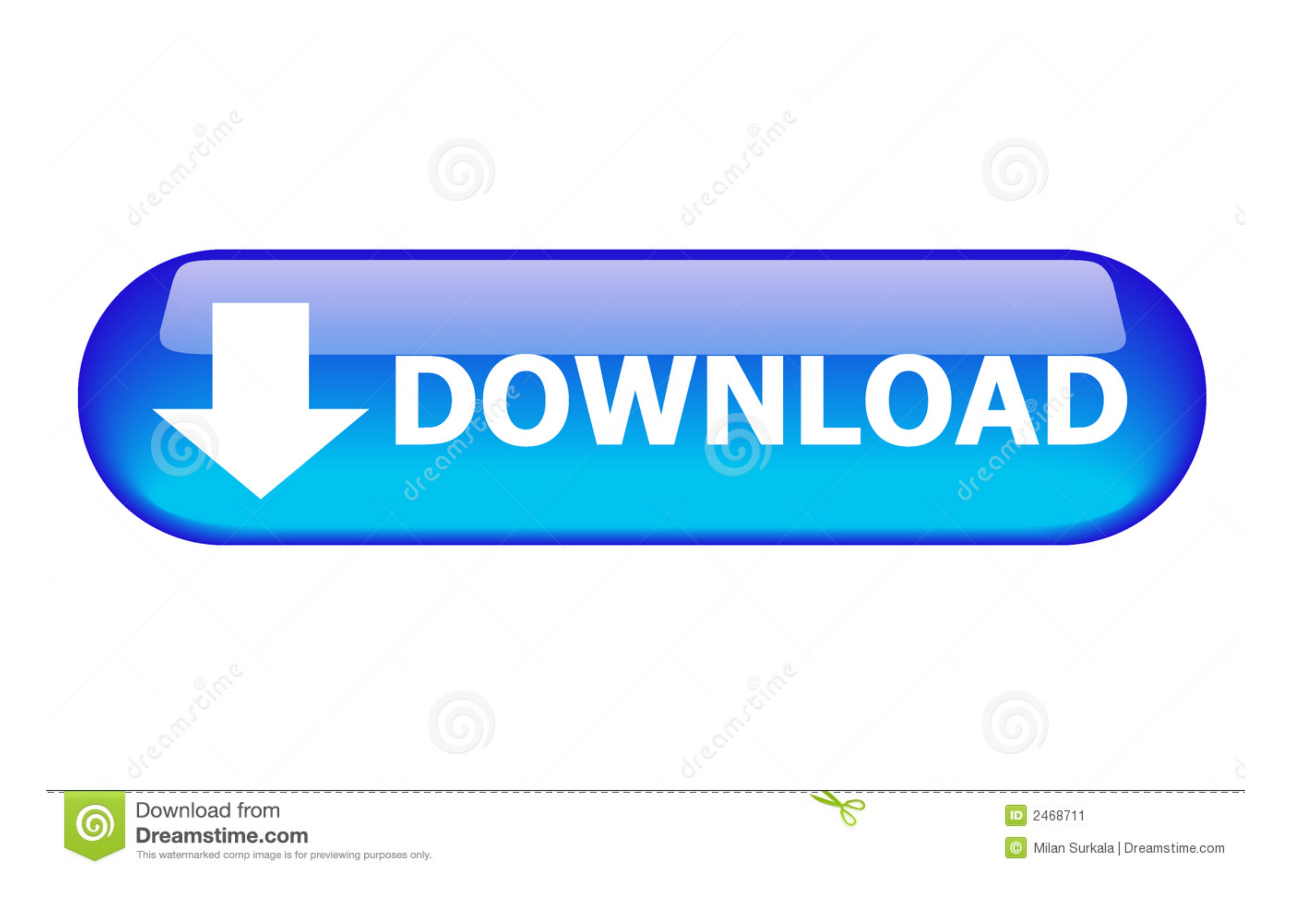
The Transporter The Series Ita Torrent